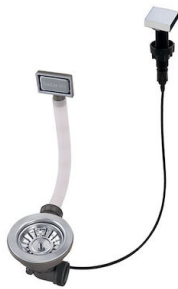
Automatic waste fitting - PM 8407 113