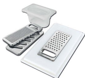
Graters kit with ring-holder and food collection tray 8159 101